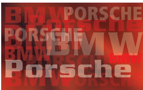
Zimmermann pb:z brake pads are available for selected applications