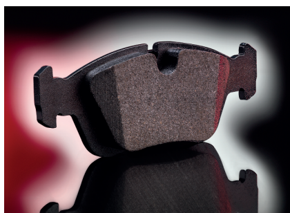
pb:z brake pad, e.g. with chamfer