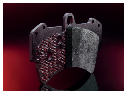
Combed backing plate for a higher shear strength